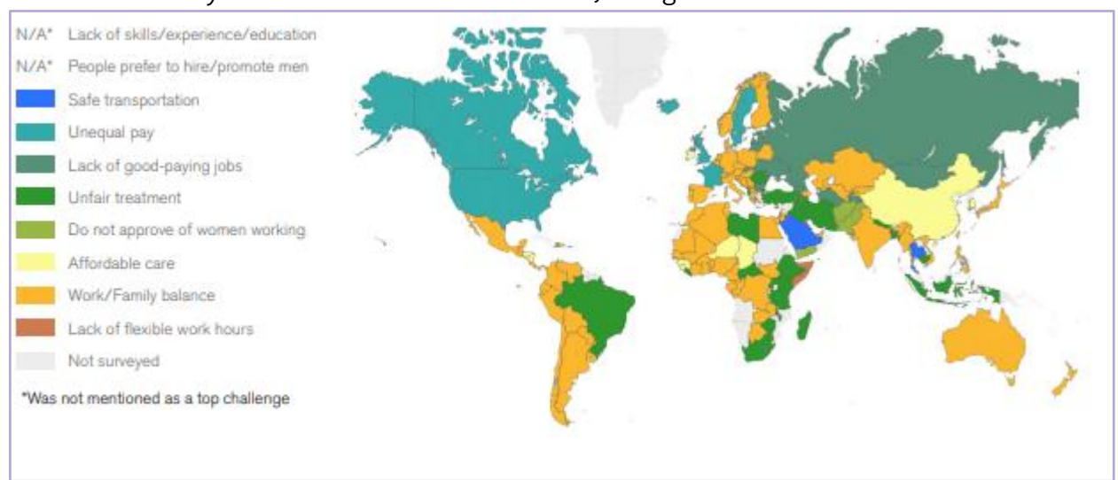
Figure 1 Barriers Faced by Women Around the World in Joining the Labor Force